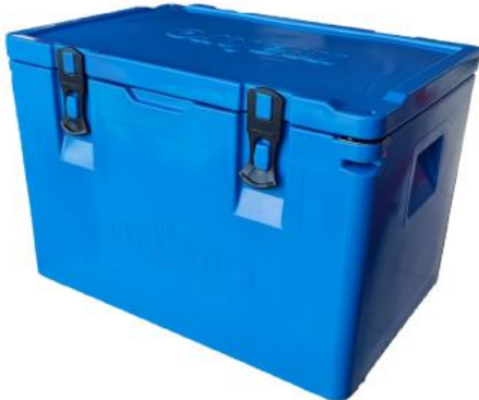
Ai-CC60 Chilled Thermotainer