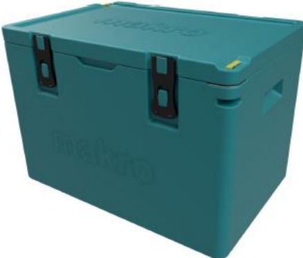
Ai-CF40 Freezing Thermotainer