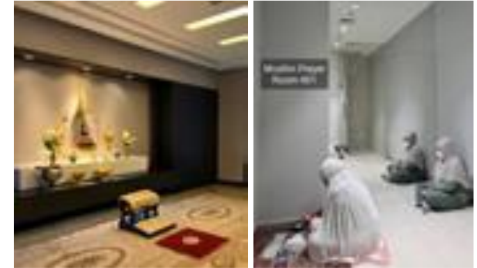
Prayer rooms for Religions

100% of store and head office have the Lactation rooms