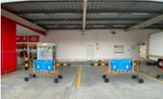
Parking and toilet for wheelchair users

100% of store and head office have the parking lot, sloping and toilet for wheelchair and older person