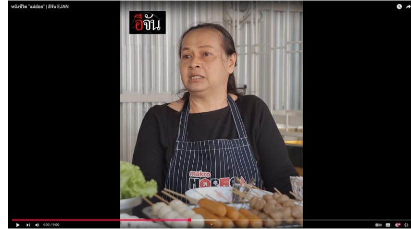
Click here to watch: หนึ่งชีวิต "แม่ฮ้อย" | ฮัจัน EJAN **For English subtitle, you can switch on Closed captioning (CC) auto-translate to English on YouTube